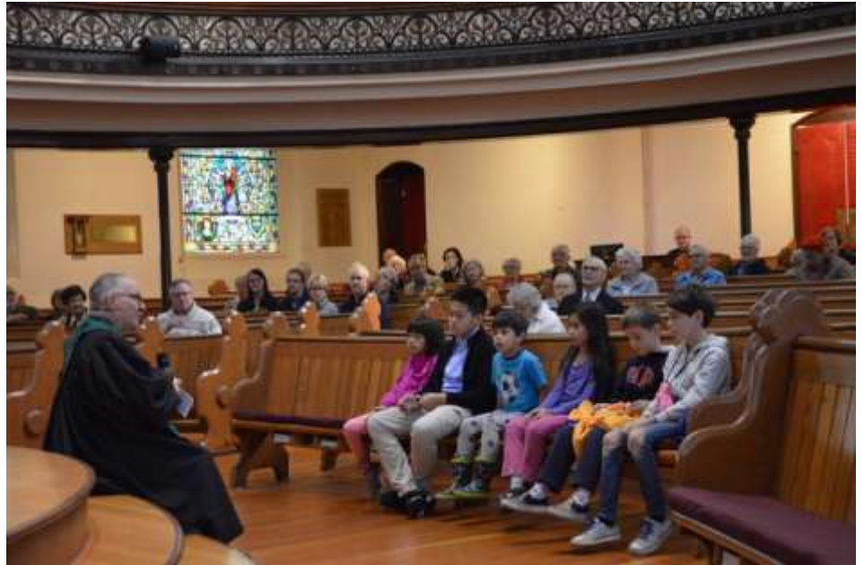
A Word to the boys and girls on September 16.