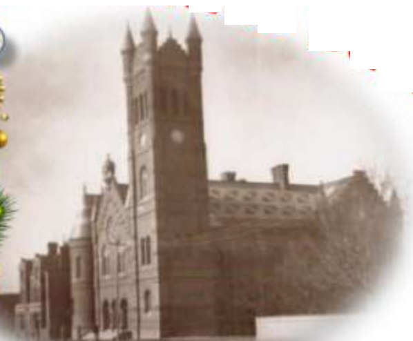
Downtown – Douglas at Broughton