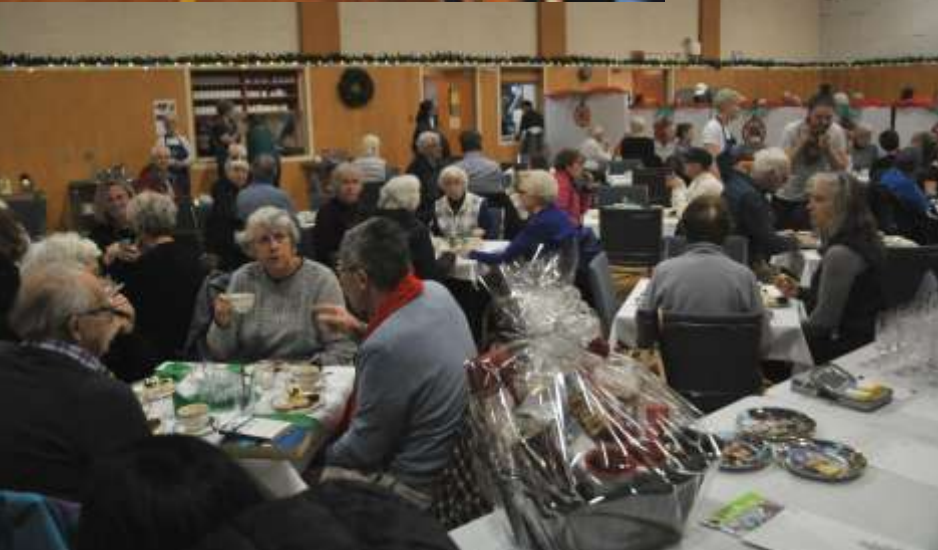
Busy tea tables.