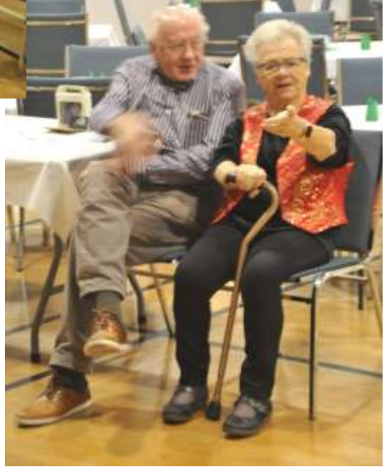
Taking a break.