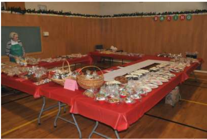
The bake table - ready to go!