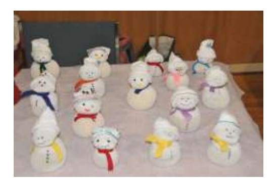
Children's World Vision Project.