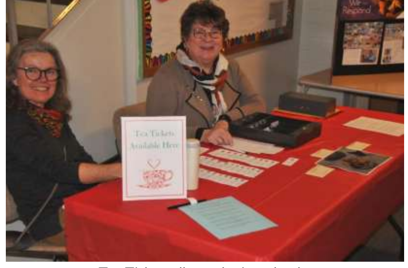
Tea Ticket sellers - sharing a laugh.