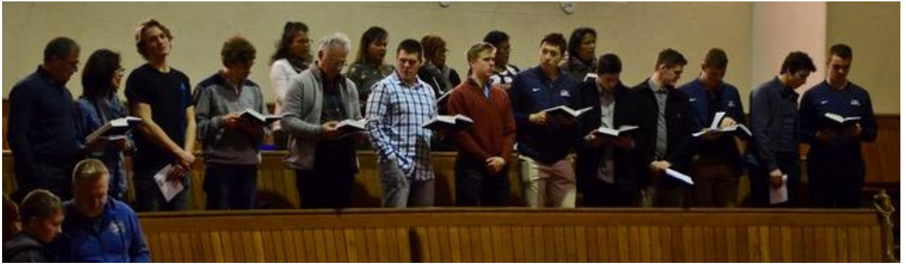
St. Andrew's was honoured to have the USA Junior Hockey team worship with us. They are seen in the balcony on Christmas Eve. They were treated to cookies made by the congregation.