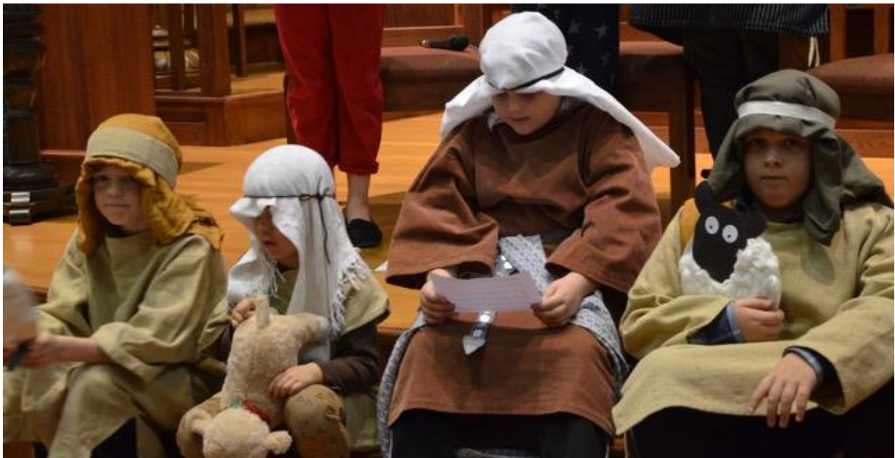
The shepherds watched their flocks by night!