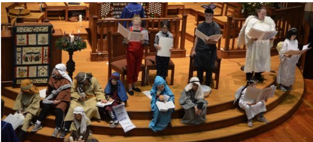
And the angels appeared.