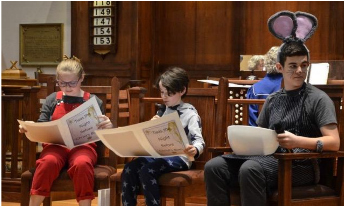
T'was the night before Christmas ...