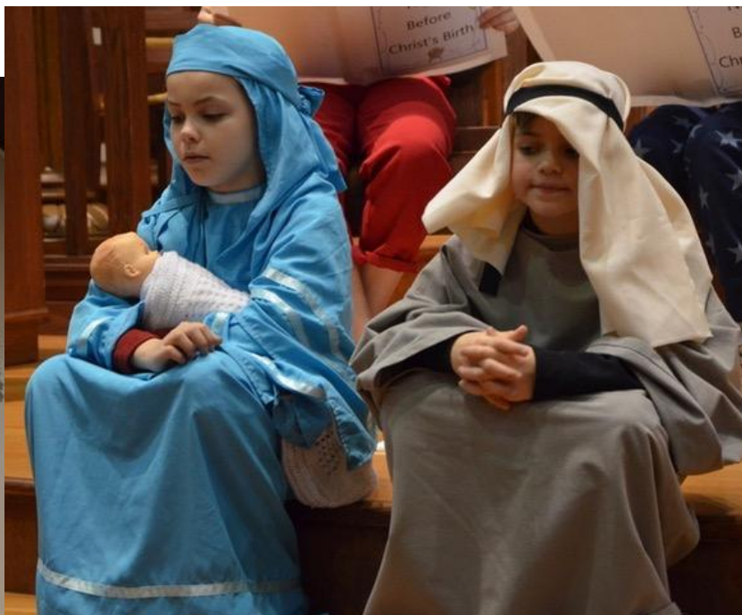
Mary and Joseph