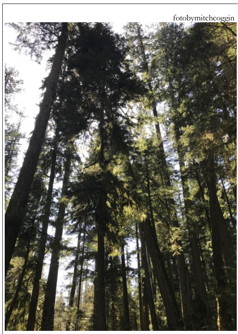
Cathedral Grove - Vancouver Island