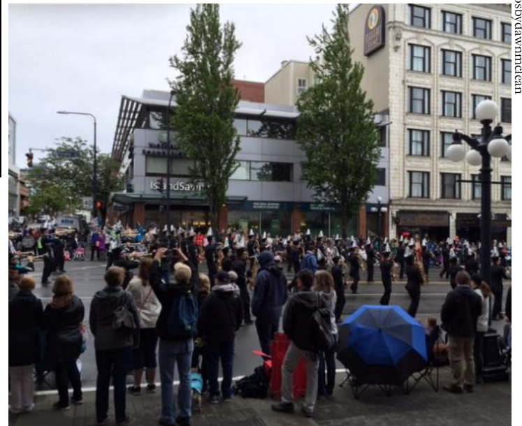
Watching the Victoria Day Parade. Open Church at St. Andrew's