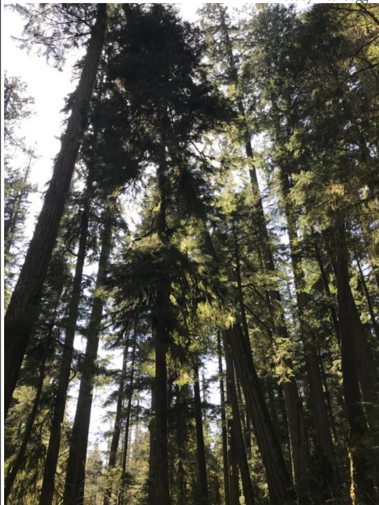
Cathedral Grove - Vancouver Island