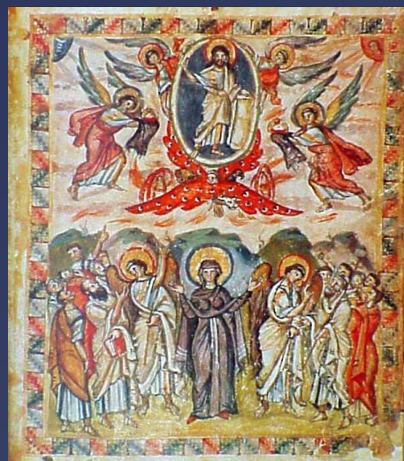
This image is from the Rabula Gospels, a 6th century illuminated text.

"While he was blessing them, he left them and was taken up into heaven." - Luke 24:51